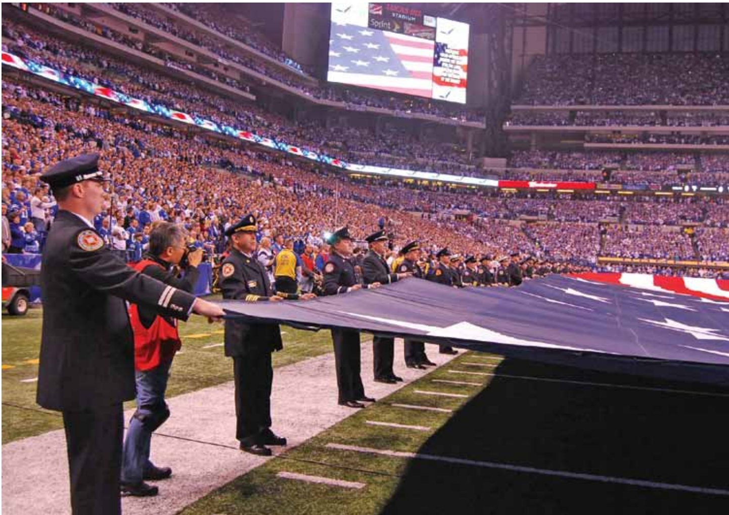
The Indianapolis Fire Department presented the flag before the Indianapolis Colts game on November 15th against the New England Patriots.