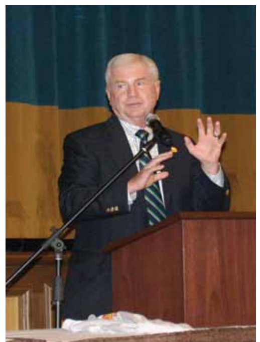
Senator Ed Charbonneau