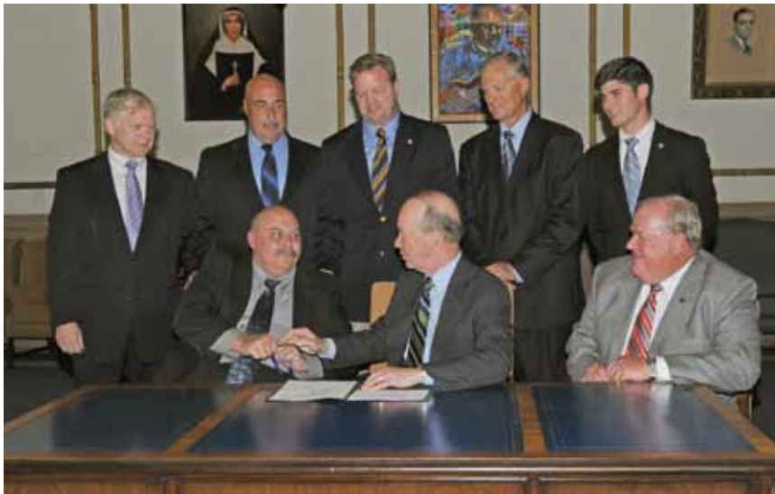
BILL SIGNING: JUNE 2, 2011