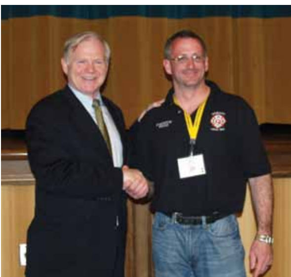
Hobart L1641 presented a PAC check to the PFFUI