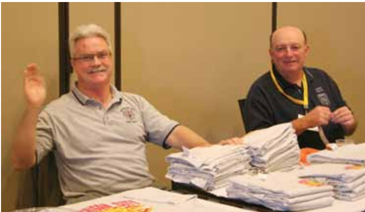
The Brothers from Michigan City worked long and hard to put on a great convention.